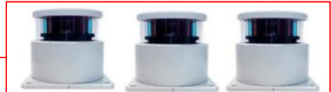
For use with Consolite Navigation Lights CTL-9xx